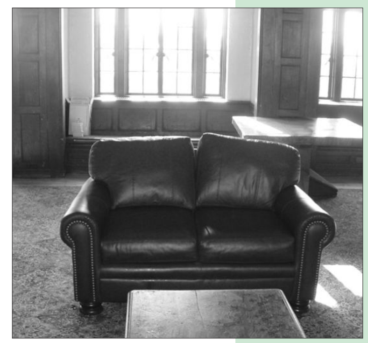
Our new leather sofas are classy and very comfortable.