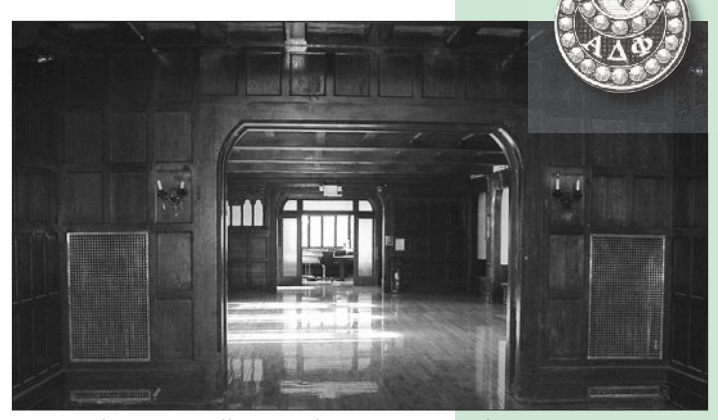
The Great Hall now makes a very strong first impression.