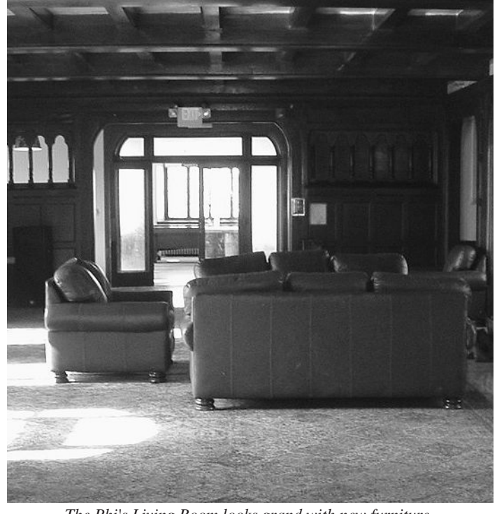
The Phi's Living Room looks grand with new furniture.