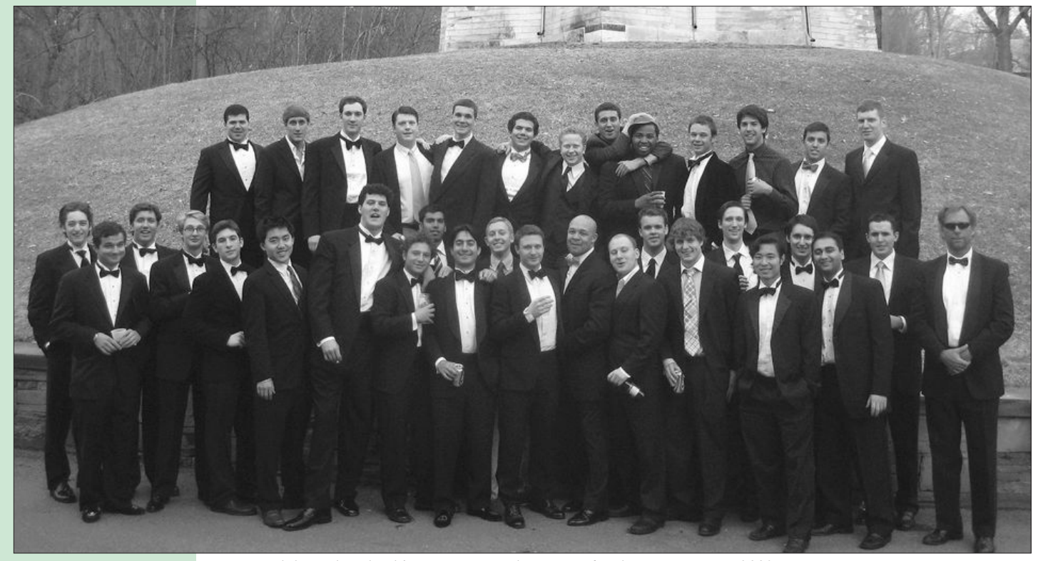
Alpha Delta Phi elder statesmen welcome new brothers at Initiation 2008.