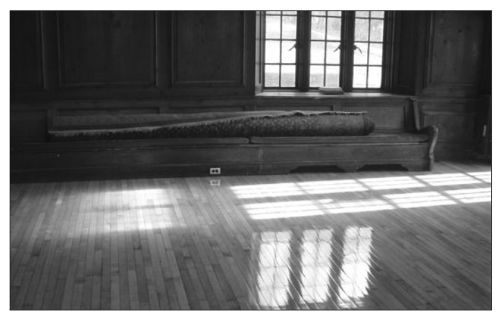
So bright you can see yourself in reflection!