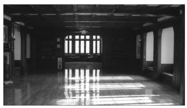
The Living Room floor after refinishing