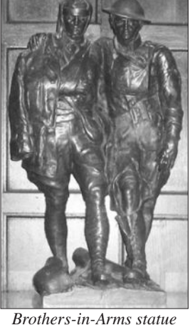
at AΔΦ Cornell