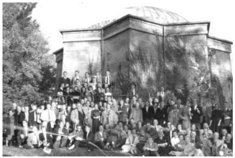
Alpha Delts gather in front of the Goat House.

and digital cable, and several large communal bathrooms, all renovated in 2003. The wood-paneled library on the first floor provides a guiet place to study, while the large living room-with fireplace, carpet, and leather couches-offers a comfortable space for brothers to converse in. The Tower, on the third floor, provides incredible views of Cayuga Lake, while the Solarium, at the back of the house with a pool table and big screen television, gives members a place to unwind after class. All meals are offered to brothers in our star-shaped dining room, a structure unique in America; our kitchen, and access to industrial-grade appliances, is available around the clock. A recent $90,000 capital renovation project has brought numerous improvements to the Phi, including a bluestone patio in the front of the house, and a completely remodeled 2,000 square foot downstairs social space with dimmable lighting and plenty of room for socializing and dancing. And, of course, the secrets of the Goat House are known only to brothers.