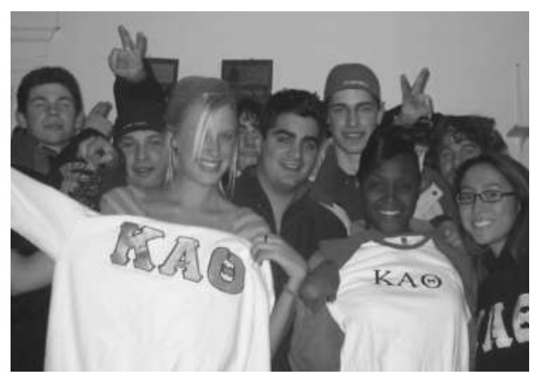
Alpha Delts mix it up with sisters of Kappa Alpha Theta.

This is a topic we take very seriously. The student House Manager and President are obligated to reside in the house, which helps to ensure that they are aware of and can promptly attend to any repairs. We have a full fire alarm system, full sprinkler system and full fire suppression systems that are inspected four times per year. In addition, unlike many fraternity structures new and old, our house is a cast concrete and stone building, meaning fire safety is built in. Annually, the Ithaca Fire Department inspects the entire structure, and every three years the Ithaca Building Department inspects every space in the house. The house could not be occupied unless it met all building and fire codes.