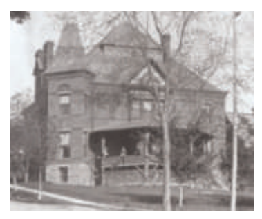
The original Alpha Delta Phi on Buffalo Street in the 1880s.

remains one of the oldest continuously run studentled organizations on campus. Members initially lived on Tioga Street in Collegetown until funds were secured by alumni to build a permanent house on Buffalo Street in 1878. It is believed that the large brick structure constructed there, lodging a mere 16