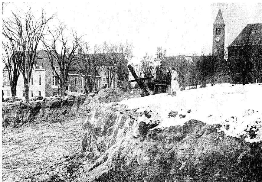
CORNELL ALUMNI NEWS

Where Olin Hall for Chemical Engineering is Being Built